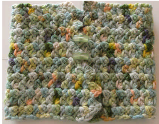
Misti Alpaca version, courtesy of Adrienne in Italy.