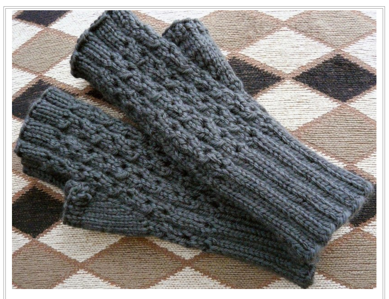
These mitts can be worn on either the left or right hand